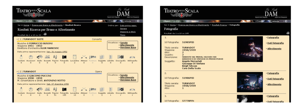
Fig. 5. The synoptic view of events.