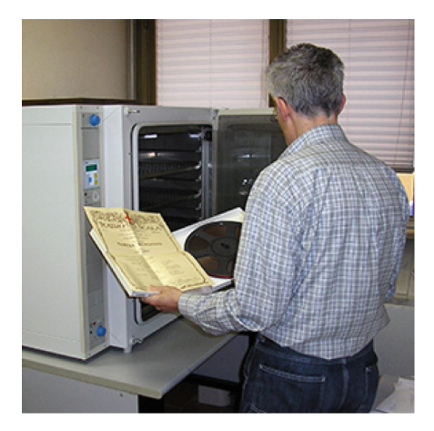
Fig. 2. The Heraeus UT6200 oven used to thermally pretreat magnetic tapes.