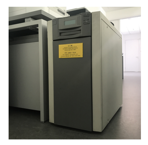
Fig. 3. The CD-R jukebox in use in the MAIS project.

second decade of the 20<sup>th</sup> Century to present. In 2006, La Scala DAM was connected to the theater's intranet, thus supporting the everyday activities of every sector and constituting an internal authoritative source for the creation, production and documentation of each show. Based on a relational database, whose structure is described elsewhere [14], La Scala DAM supplied integrated views on performances that included metadata, sketches and costume designs, costumes, footwear, jewellery, head-dress, props, fliers and posters, photographs and audio recordings. A key page of the intranet application is shown in Fig. 5, that provided a synoptic view of events with easily accessible links towards all related metadata and materials. A second example is illustrated in Fig. 6: from this view focusing on photographic material, it was possible to jump to detailed photo descriptions, to enlarge images and to follow links towards other sections (e.g., all the materials related to a given opera, all the titles in that season, all the pictures taken in a date or by a photographer, etc.).