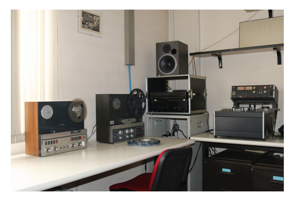
Fig. 1. Devices for open-reel magnetic tapes in the LIM digitization studio: from left to right, Revox A77, Revox B77 MKII and Otari MX-55.

MAIS was to allow content-based queries on available scores and audio materials, so as to support artists in the preparation of a performance already present in the archive. In detail, it was possible to retrieve all the scores and/or audio which contained an exact sequence of notes or a similar one.